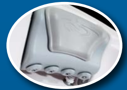
2 NeckFlex Pillows